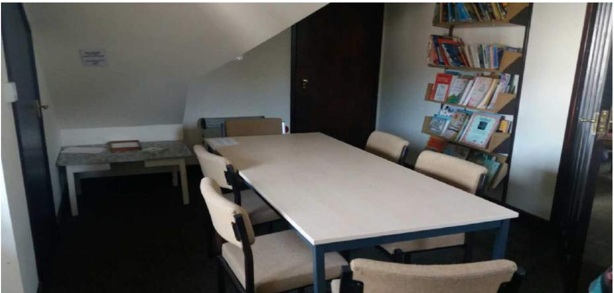
Small Meeting Room (seats 10)