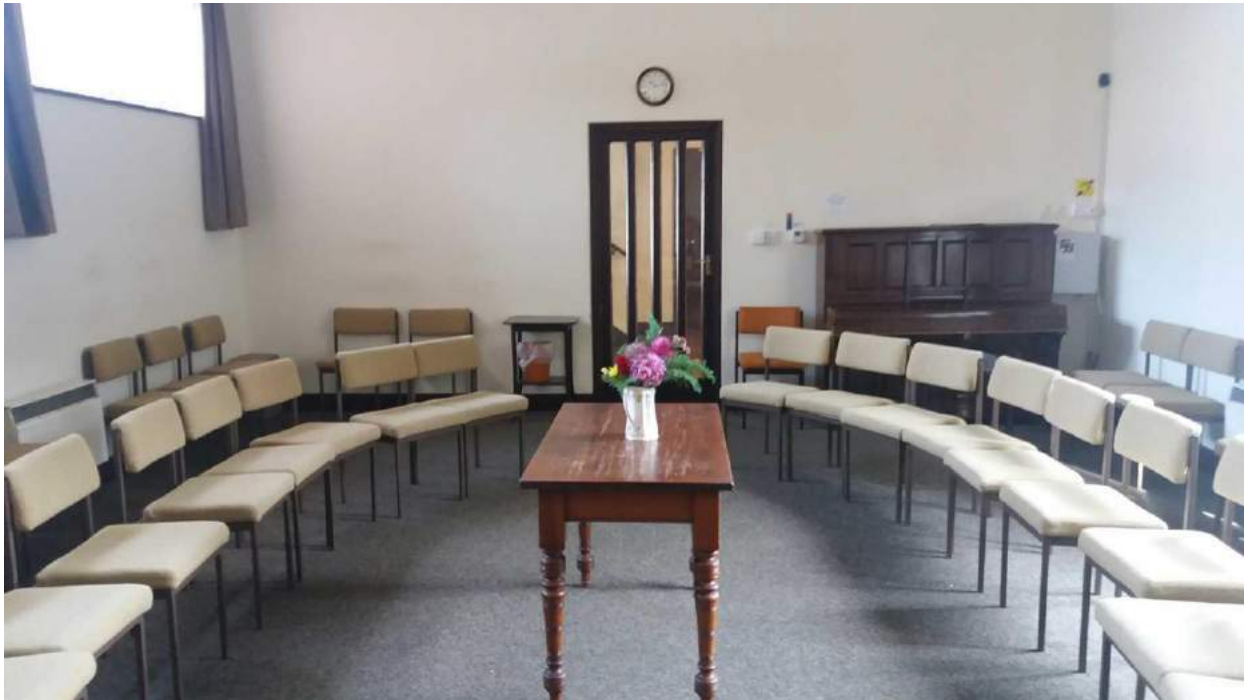
Main Meeting Room (seats 50)