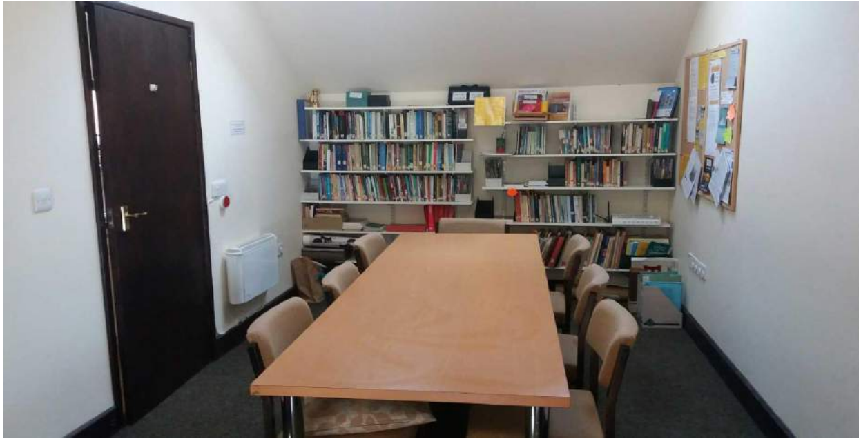
Library / Small Meeting Room (seats 10)