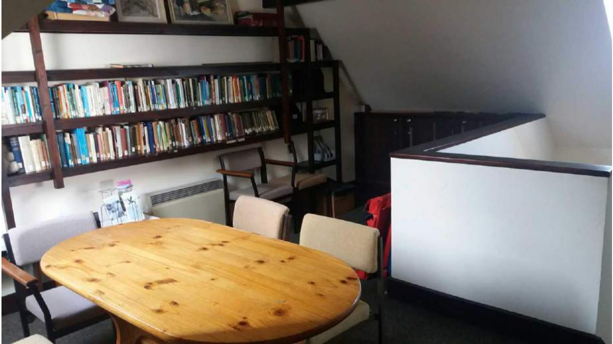
Open space at top of stairs